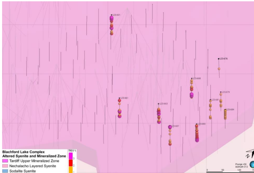
Figure 2: Projected drill strings highlighting (in colour) down-hole assays of the 10 drillholes released in this parcel of results from the 2023 drill program with a simplified geological underlay of the Blachford Lake Complex. Assay results: Yellow 1-2% TREO, Red 2-3% TREO and Fuchsia >3% TREO.

These new drill data reinforce the differentiated grade potential of the system and highlight high grades, with grades of or above 3.0% TREO at multiple locations on the 2023 drill grid, adding to areas uncovered in earlier released results from the 2023 drill program. Shallow higher-grade mineralisation (mainly starting <40 metres depth) is hosted within biotite altered syenite and as well as altered aegirine, K-feldspar syenite, indicating potential lateral continuity in several areas on the grid pattern: Hole 631 returned particular interesting results with an intersection grading up to 7.95% TREO . A number of proximal holes have been completed with results pending.