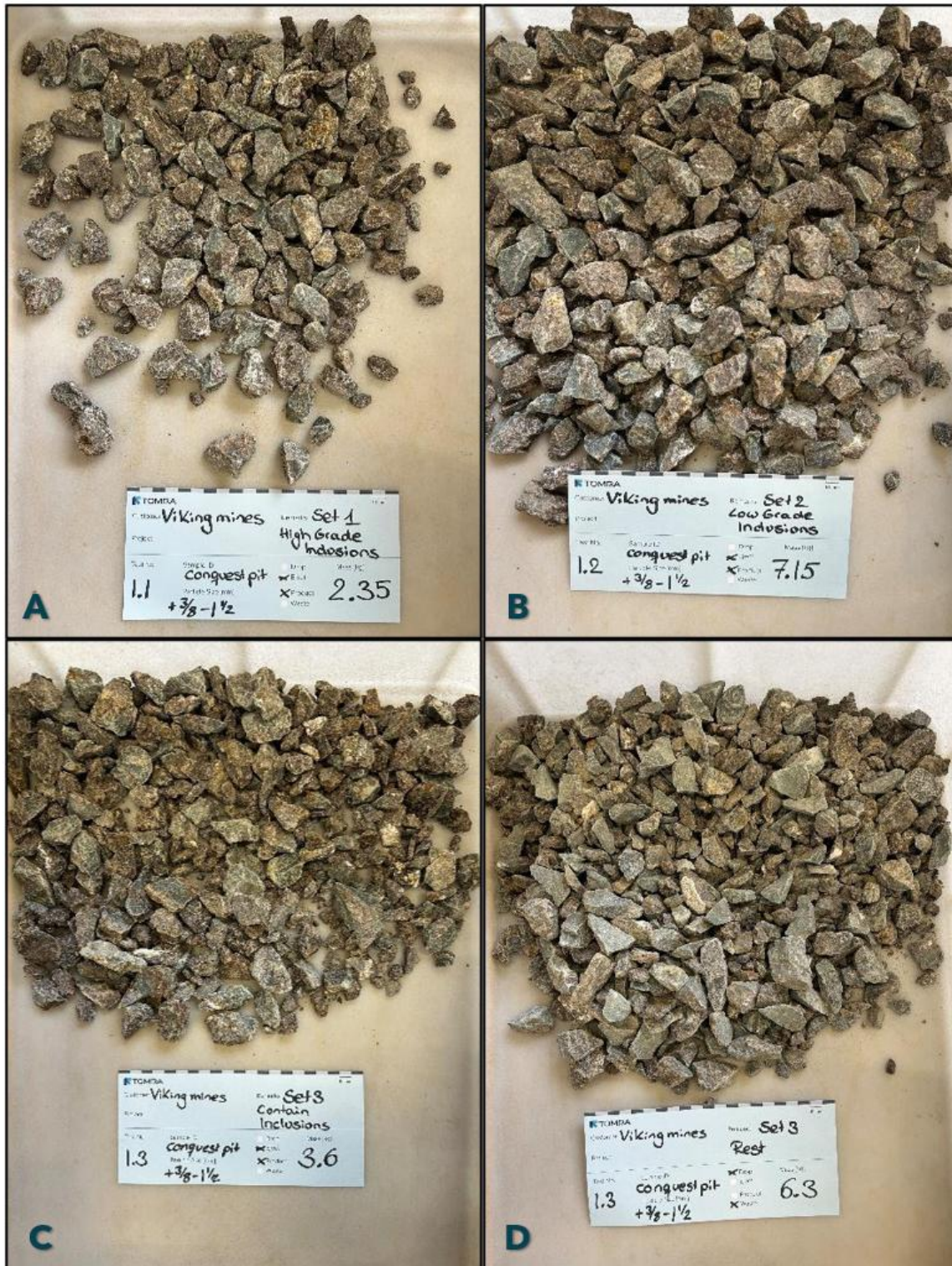
Figure 2; TOMRA XRT sorted fractions from the Conquest Pit sample: A: Set 1 High Grade Inclusions, B: Set 2 Low Grade Inclusions, C: Set 3 CONTAIN™ Inclusions and D: Waste (clockwise from top left).

For the Conquest Pit sample, approximately 68% of feed mass reported to the three product streams, with the balance rejected as waste (Figure 2). Visible scheelite was confirmed in the high-grade product fraction under ultraviolet (blacklight) illumination (Figure 1). For the Linka Stockpile sample, approximately 56% of feed mass reported to product streams (Figure 3). Product fraction assays have not yet been completed; TOMRA does not assay sorted fractions in order to retain independence, and the fractions have been returned to the Company's metallurgical laboratory in Canada for analysis, with results expected in the second half of July 2026.