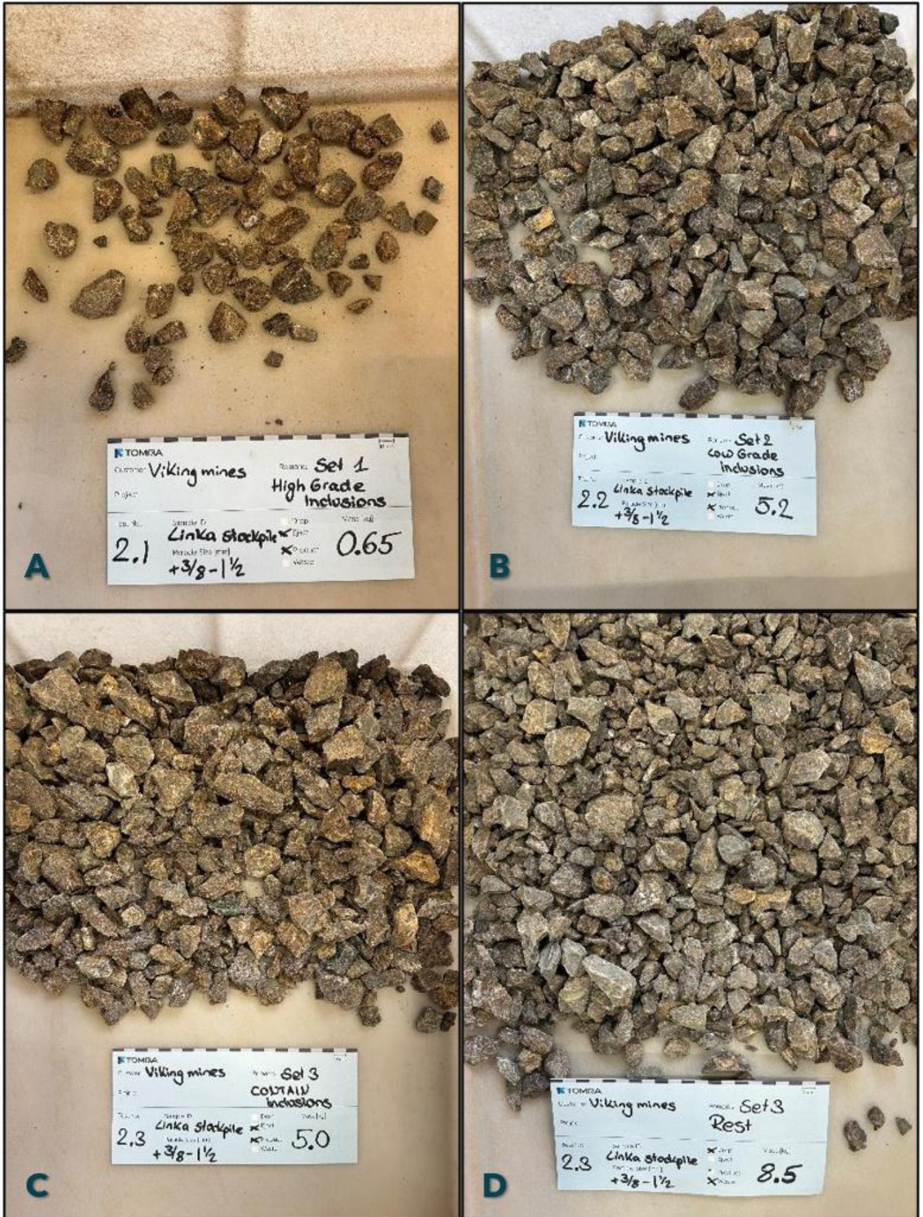
Figure 3; TOMRA XRT sorted fractions from the Linka Stockpile sample: A: Set 1 High Grade Inclusions, B: Set 2 Low Grade Inclusions, C: Set 3 CONTAIN™ Inclusions and D: Waste (clockwise from top left).