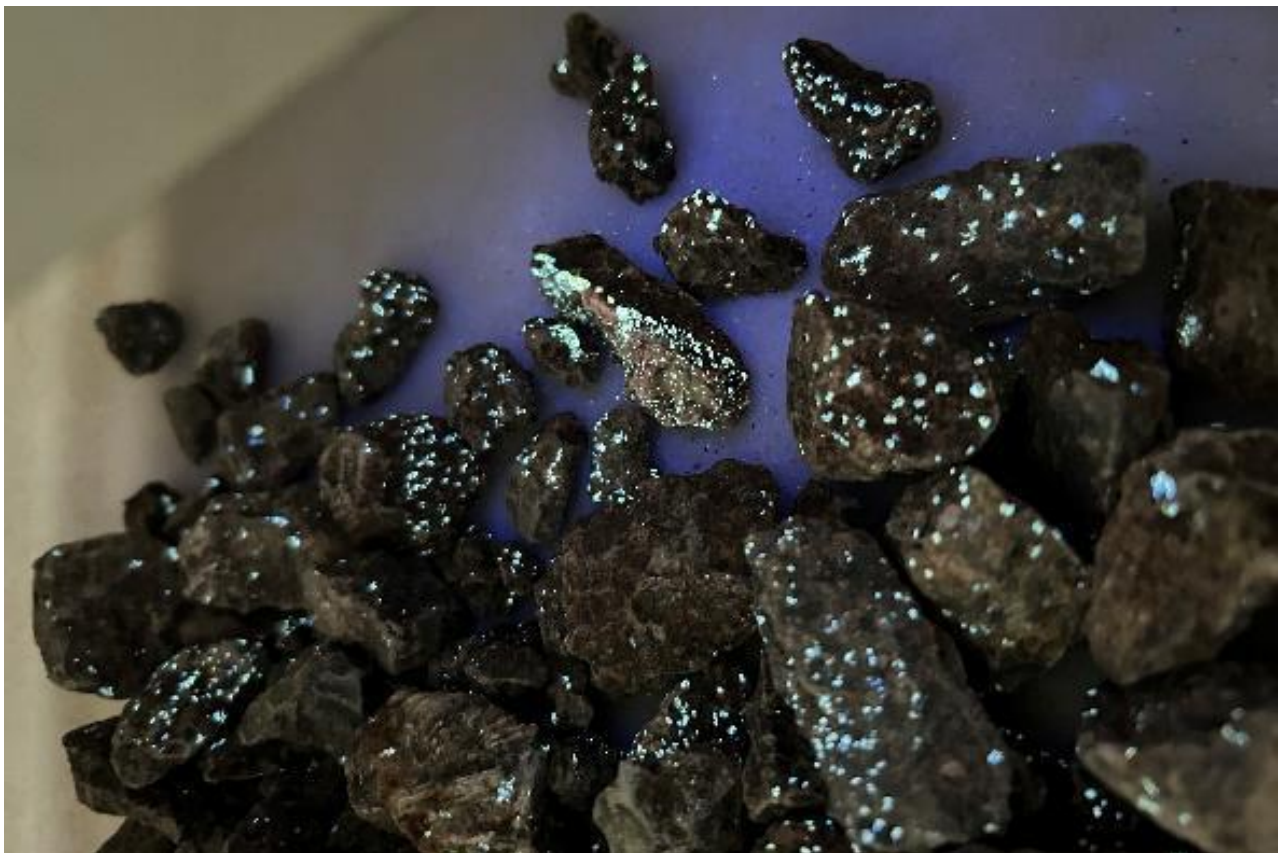
Figure 1; High-grade sorted fraction (Set 1) from the Conquest Pit sample under ultraviolet light, showing characteristic blue-white fluorescence of scheelite. Visual estimate containing between ~1.5% to ~3.5% scheelite (~1.2% to ~2.8% WO 3 ). Refer to Appendix 1. Assay results expected late July 2026.

Cautionary Statement: Visual estimates of mineral presence should never be considered a proxy or substitute for laboratory analyses where concentrations or grades are the factor of principal economic interest. Visual estimates also potentially provide no information regarding impurities or deleterious physical properties relevant to valuations.