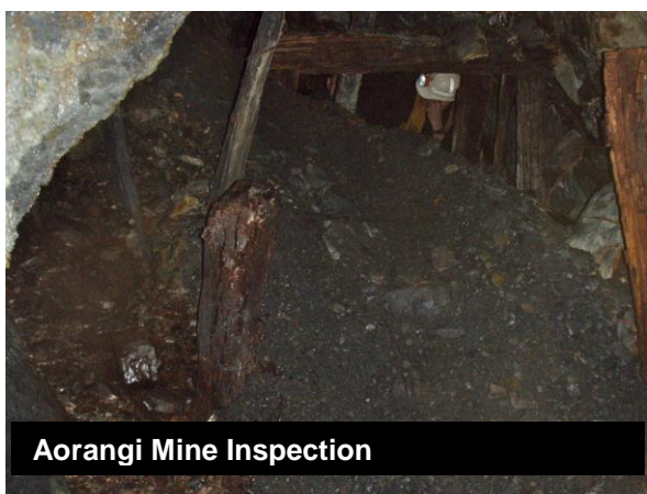
Aorangi Mine Inspection

Recent underground sampling from easily accessible upper levels of the mine reported up to 13.2 g/t gold and grab sampling up to 16.5 g/t was announced from the Aorangi Mine 11 . These results come after the recent high grade results from virgin exploration ground approx. 6km south west of the Aorangi Mine at the West Wanganui prospect. The Company is the first modern explorer into much of this heavily vegetated area. Panned concentrates reported 12 high grades of 24.33 g/t, 14.49 g/t, 4.07 g/t and 3.54 g/t gold . The project is 100% owned by Strategic Materials Pty Ltd.