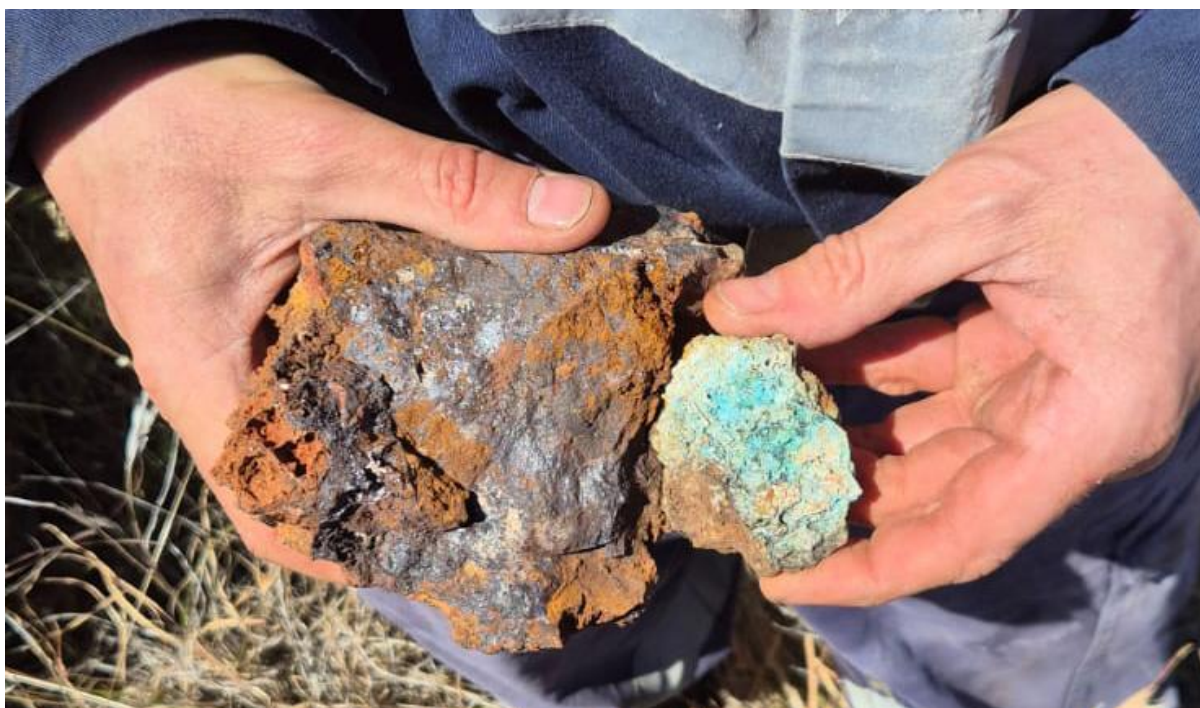
Figure 3. Gossan outcrop (482389E, 7438704N, Sample RK0072) showing classic ex-sulphide boxwork texture identified at VT1 immediately along strike from outcropping Oonagalabi Formation marble with oxidised copper mineralisation present. See Appendix 1 for laboratory assay results. 2

Visual estimates of mineral abundance results should never be considered a proxy or substitute for laboratory analyses where concentrations of grades are the factors of principal economic interest. Visual estimates also potentially provide no information regarding impurities or deleterious physical properties relevant to valuation.