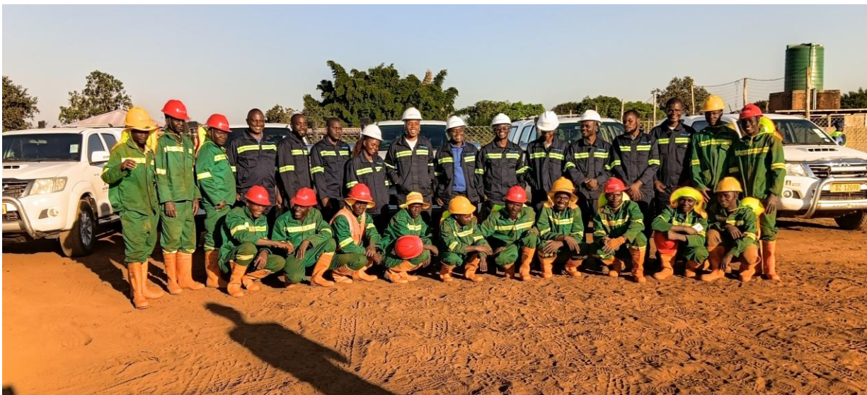
Figure 2. Akatswiri Geologists and Technicians (navy) and Drilling team (green).

The Company has completed 422 hand auger drill holes on a nominal 200m spacing across the high-priority rutile mineralised areas of the Mkanda project, with the 5,000m aircore drilling program due to commence in the coming weeks. The 2026 drilling programs consist of 6,500m of hand auger drilling, 5,000m aircore drilling and 30 push tube/core drilling programs to deliver expanded, high-confidence resource estimates. These drilling programs are designed to assess the potential for rutile, graphite and rare earth mineralisation to extend over large areas and link high-grade anomalies defined to date. Results are anticipated to be reported regularly throughout 2026 and H1 2027.