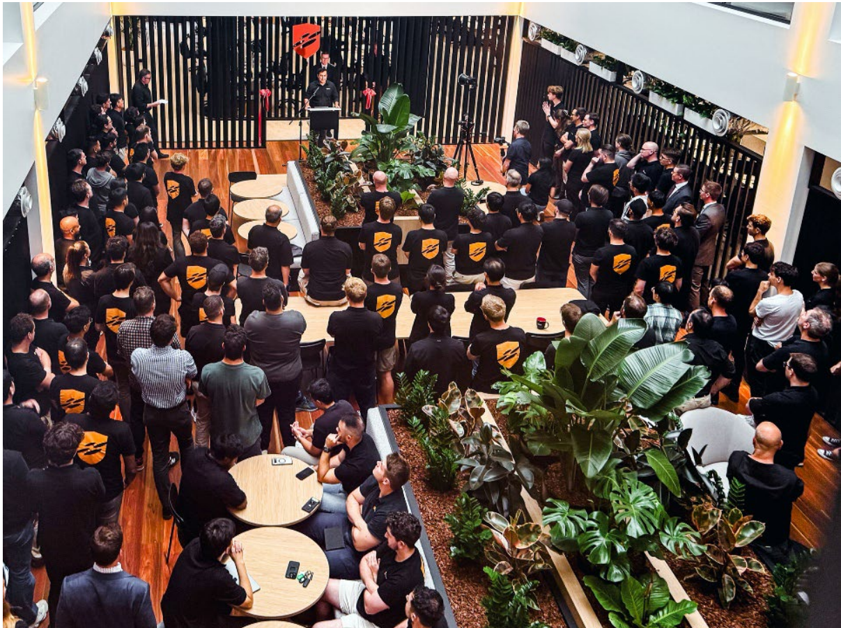
Image: The Hon Pat Conroy MP, Australian Minister for Defence Industry, opening DroneShield's Sydney Office in March 2025

The SIP contract has been reported to be approximately $45 million in the media. This leaves the substantial majority of the LAND156 program remaining, of the $1.3bn total value, over the next 10 years, committed to the program by the Defence Industry Minister Pat Conroy in his announcement on 19 August 2025. DroneShield anticipates being well positioned for an appropriate part of the program, and will update the market, as further information becomes available.