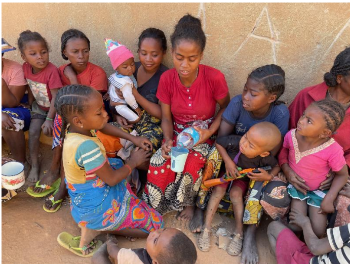
Figure 4 – Local Communities Members