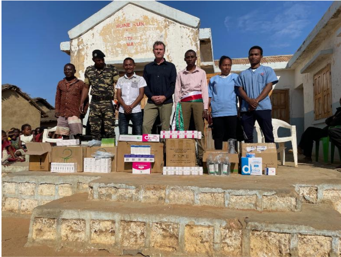
Figure 3 - Presentation of Medical Supplies